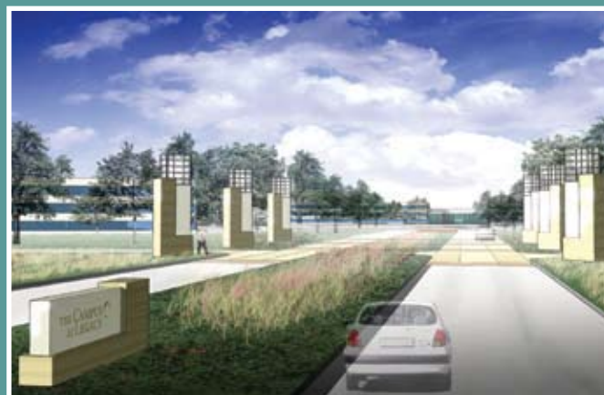
Phase 1 of the redevelopment includes a new main entrance at Legacy and Hedgcoxe.